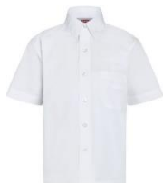
White cotton shirt with buttons