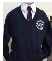
Navy V-neck sweatshirt