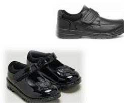
Sensible black shoes