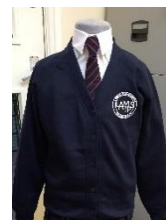
Navy V-neck cardigan