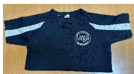
Navy & White PE Shirt